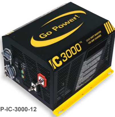
Model # GP-IC-3000-12